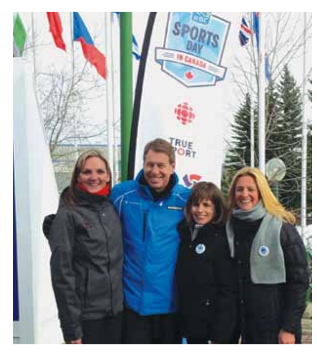
RBC Sports Day in Canada media tour

In recognition of the belief that good sport can make a great difference, the Summer Games host society declared the 2013 Sherbrooke Summer Canada Games a True Sport Event. Athletes, coaches and officials pledged their commitment to the True Sport Principles as part of the opening ceremonies. A True Sport outreach booth was also set up at the athletes' village for athletes to learn about values-based sport initiatives. A photo challenge engaged athletes and participants to capture and share their favourite True Sport Games moments.