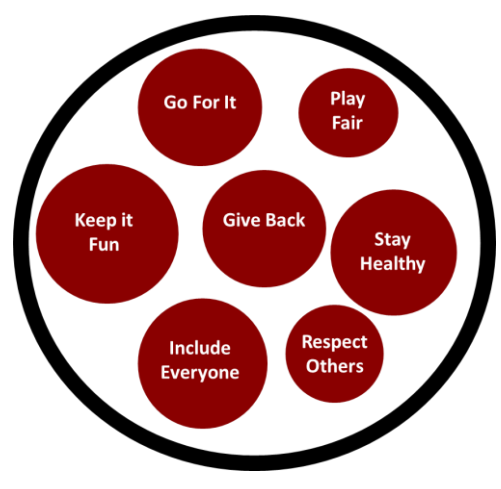
Figure 1: True Sport Principles

The Expert Working Group further sought a balance among the seven True Sport Principles. Sport, at its best, balances a series of principles to create a fair, safe, inclusive and open environment. Depending on the level of sport, these principles need to exist in different degrees and proportions. Creating good sport policy is about finding a balance between these principles while keeping all of them present in a way that makes sport a positive experience for everyone.